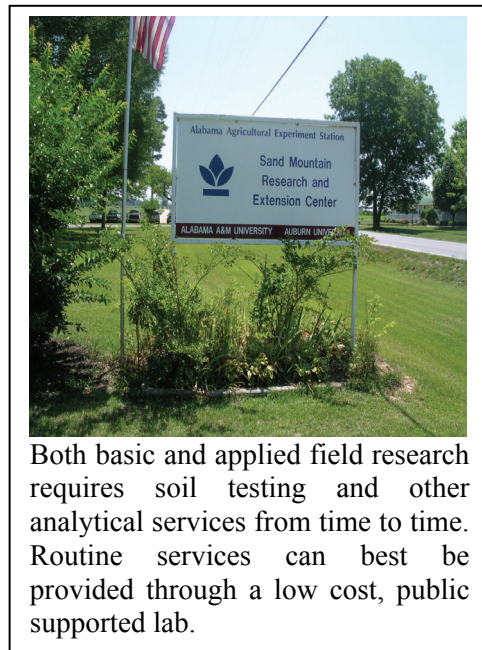
Both basic and applied field research requires soil testing and other analytical services from time to time. Routine services can best be provided through a low cost, public supported lab.

are needed and serve as a reliable and consolidated resource for many faculty. Without them, faculty would have to do the analytical work in their own busy research laboratories. Providing this low cost research service is often a bonus of having a public service laboratory on campus. In many cases, faculty associated with the laboratory become collaborators in the research, because the analytical component of the research may require further development to meet the objectives of the project.