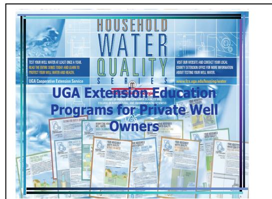
Educational materials available to the general public.

household water test results for private well owners, one public laboratory provides clients with educational information on drinking water and human health through their County Extension programs. County program topics include treatment options if