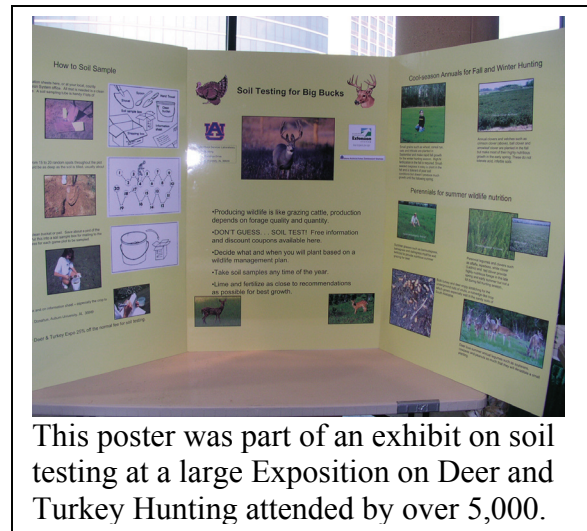
This poster was part of an exhibit on soil testing at a large Exposition on Deer and Turkey Hunting attended by over 5,000.

laboratories serve as the focal point for plant nutrient calibration and related studies, so it is logical for the laboratory to also study, develop, and improve existing analytical methods. Furthermore, as new instrumentation becomes available, adaptation to analysis of soil, plant, and other materials is best done by public laboratories with highly qualified personnel who can properly and objectively evaluate