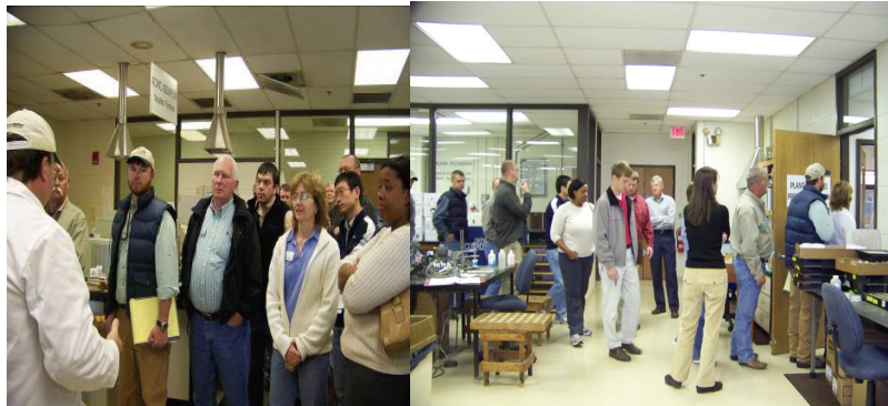
Provide training to homeowners and extension agents.

6. Public laboratories help to educate the general public about the importance of land stewardship and its proper care and management. Most public laboratories keep a database of soil and plant testing results from each county within their state, and some have a database of water test results. These data contain valuable information about our most important natural resources, the soil and water. Without the soil and water test database of the public laboratory, we would not know about the overall quality of these two natural resources on which we all depend.