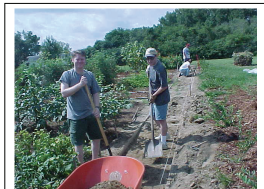
Master Gardeners provide thousands of hours of volunteer work through Land Grant programs. These volunteers depend on public analytical services to help them conduct their programs.

private laboratories. An example of this in many states are homeowners, who need soil testing services for lawns and gardens, services not readily available through private laboratories. Soil testing is one of the easiest ways to provide information to our urban and suburban residents about the