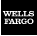
(Black box with white letters)